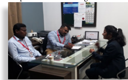
On Campus drive @ GBS